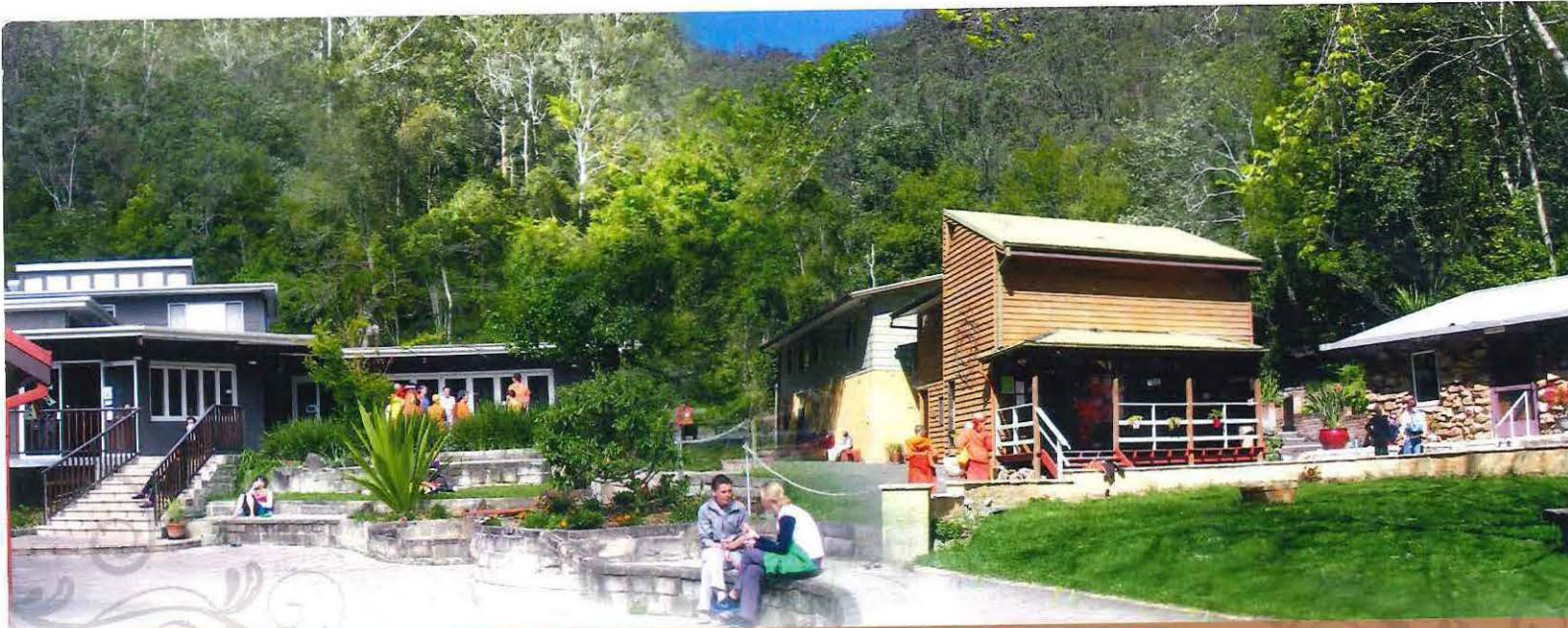
mangrove yoga ashram LIVING SATYANANDA YOGA