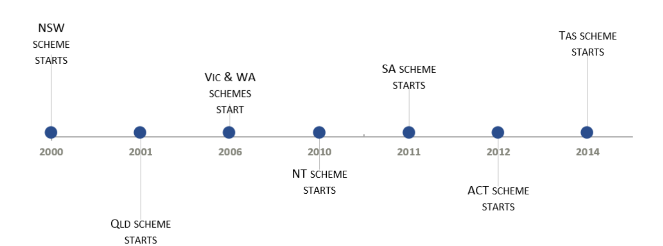
Table 1 – WWCC scheme commencement dates

WWCCs are a relatively new child protection tool, with Australia's first WWCC scheme commencing in New South Wales in 2000. All other jurisdictions have since introduced schemes to screen people for child-related work. Tasmania was the last jurisdiction to do so, with its scheme commencing in 2014.